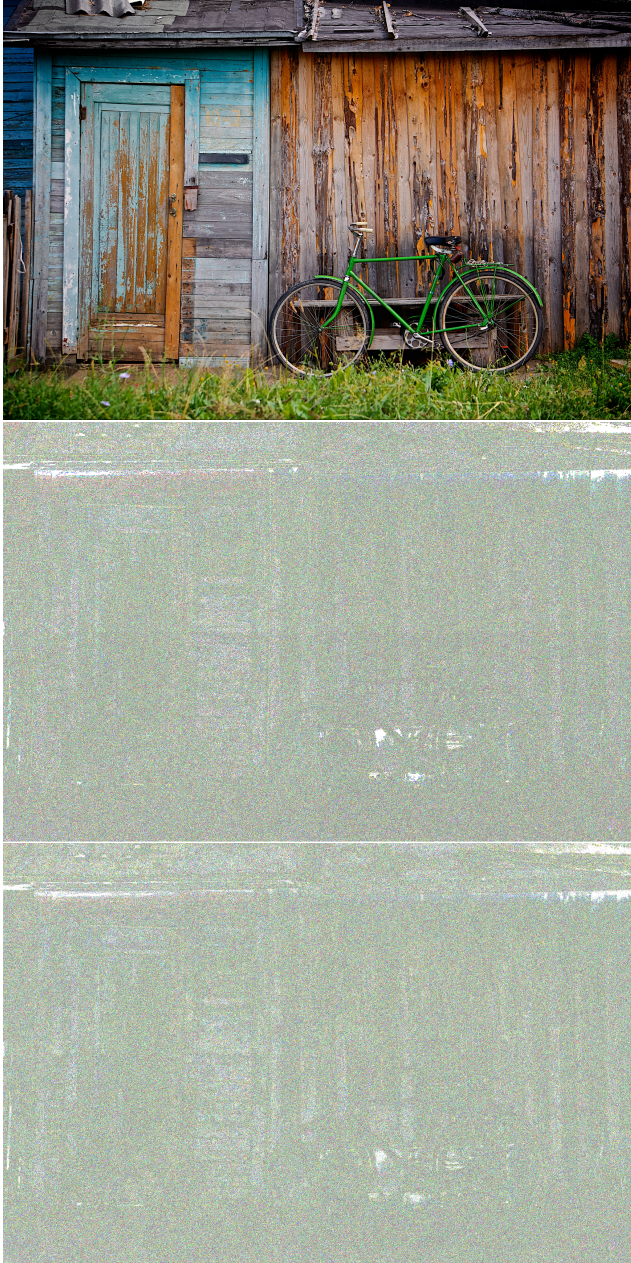
Figure A4. Example from CLIC.pro, showing x , r and a sample from p(r) . White means zero residual.