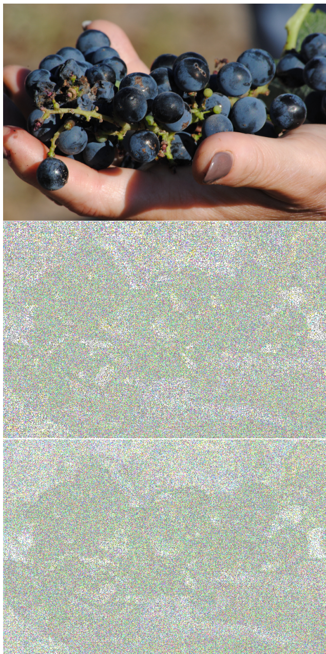
Figure A2. Example from Open Images, showing x , r and a sample from p(r) . White means zero residual.