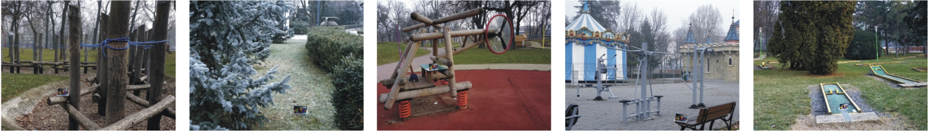
Figure 1: NH-HAZE dataset . Five sets of images of the NH-HAZE dataset.

Since NH-HAZE dataset contains ground-truth (haze-free) images, the analyzed single image dehazing techniques have been assessed quantitatively using two traditional metrics: PSNR and SSIM [42].